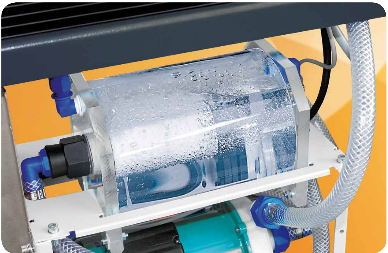
The internal water-air cooling system ensures homogeneous beam quality.

a piece of equipment that combines the toughest quality requirements with extreme cost efficiency. The PICCOLASER is constructed very compact: The four integrated motorized axes allow a repeat accuracy of 0.1 mm. An accurate control system handles movement in the x, y and z axes as well as the rotational axis. Thanks to its modular design, the system can be matched exactly to the particular technical requirements preferred.