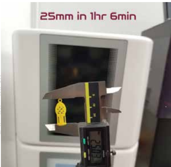
High resolution, Ready for casting