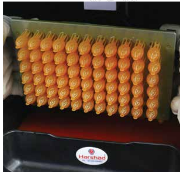
Full platform printed, No distortion