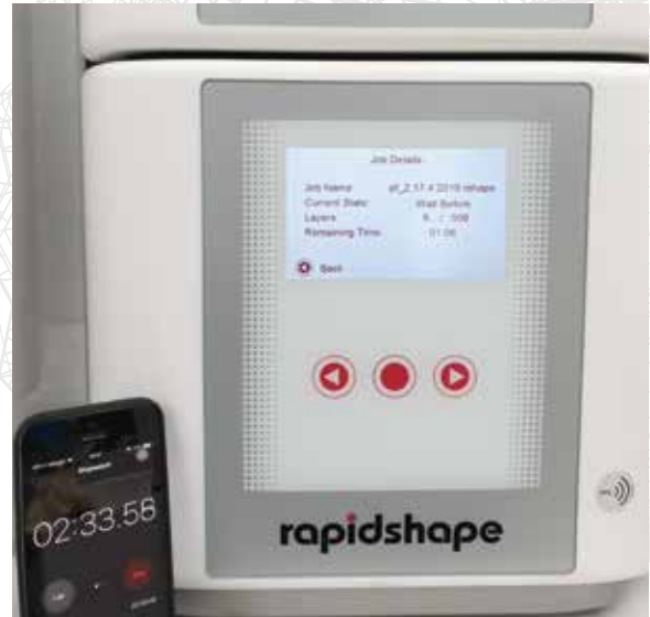
Printing 508 layers to make the 3D piece