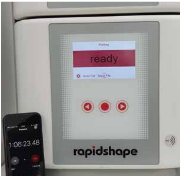
Job done in 1 hour 6 minutes