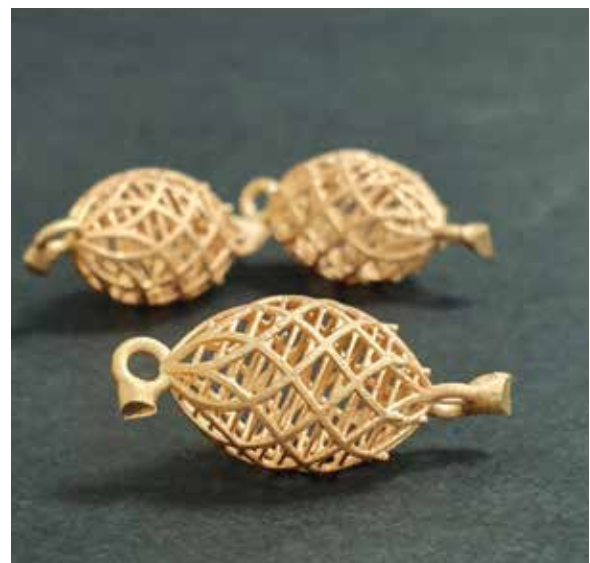
Make finest jewellery